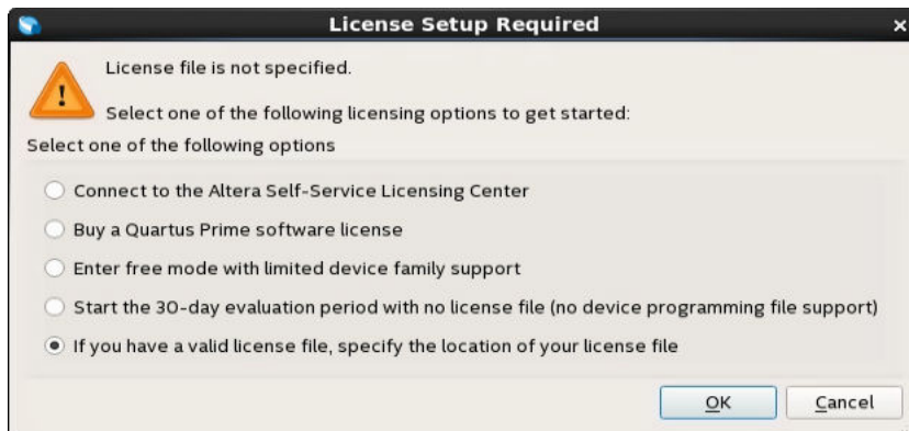
Figure 3. License Setup Required Dialog Box