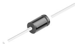
DO-35 Color Band Denotes Cathode